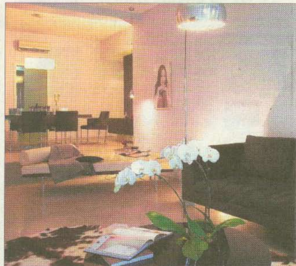
Opposites attract: A white daybed makes a stark, stylish contrast in a sea of black furniture in the living room, which comes with designer pieces like an Arco lamp.