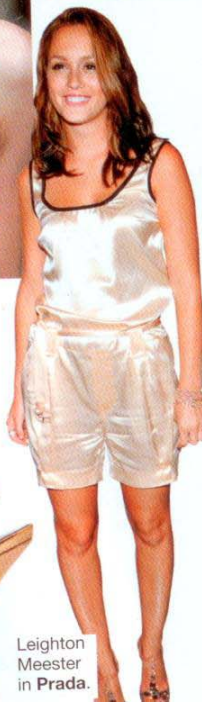
Leighton Meester in Prada.