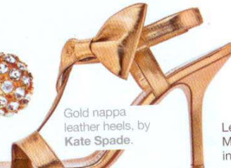
Gold nappa leather heels, by Kate Spade.