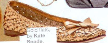
Gold flats, by Kate Spade.