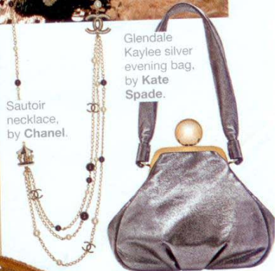
Sautoir necklace, by Chanel.