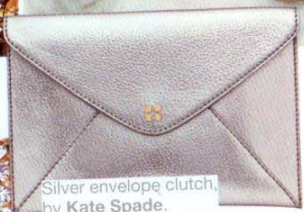
Silver envelope clutch, by Kate Spade.