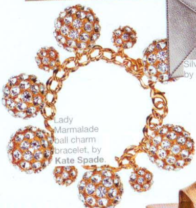
Lady Marmalade ball charm bracelet, by Kate Spade.