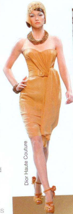
Dior Haute Couture