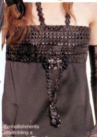
Embellishments resembling a necklace at Chanel.