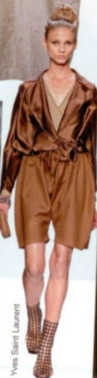
Yves Saint Laurent