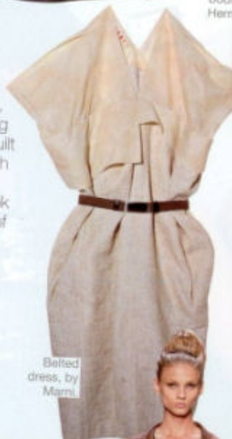
Belted dress, by Marni.