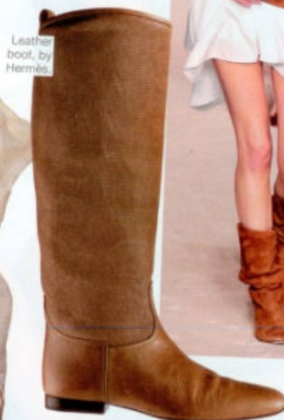
Leather boot, by Hermès.