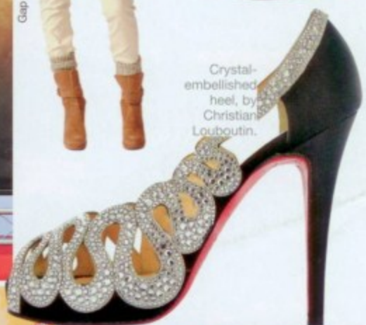
Crystal-embellished heel, by Christian Louboutin.