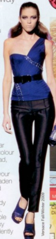
Versace Fall/Winter 2009