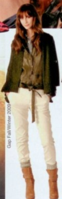
Gap Fall/Winter 2009