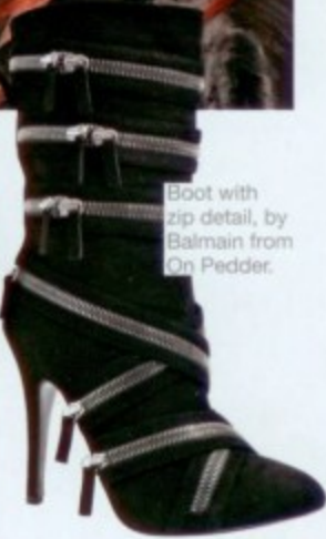
Boot with zip detail, by Balmain from On Pedder.