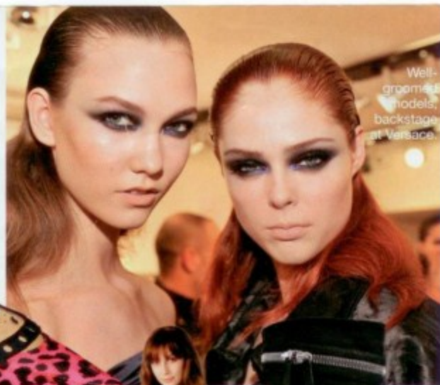
Well-groomed models, backstage at Versace.