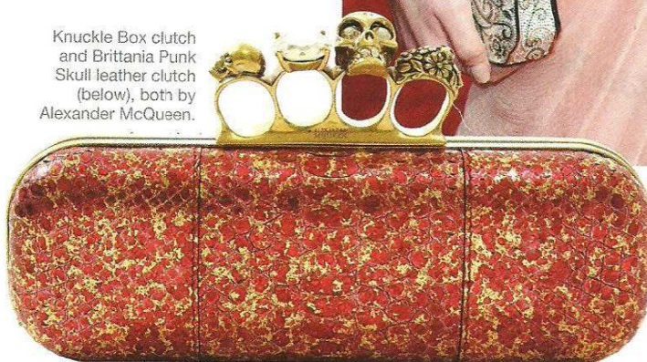
Knuckle Box clutch and Britania Punk Skull leather clutch (below), both by Alexander McQueen.