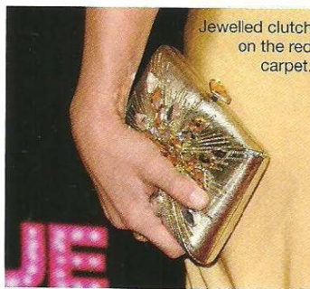
Jewelled clutch on the red carpet.

One last thing: Do not stuff your clutch to the brim — bulging, lumpy purses are never a good look. ❖