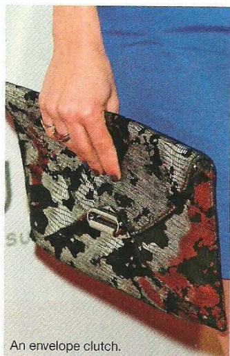
An envelope clutch.

For evening events, I'd go for an ornamental crystal minaudière from Judith Leiber, available in a variety of shapes and sizes. I also love