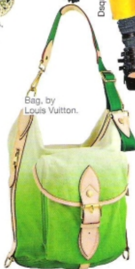
Bag, by Louis Vuitton.