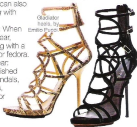
Gladiator heels, by Emilio Pucci.

dresses, leggings, biker shorts, and voilà — you're all ready for a fantastic time. ✨