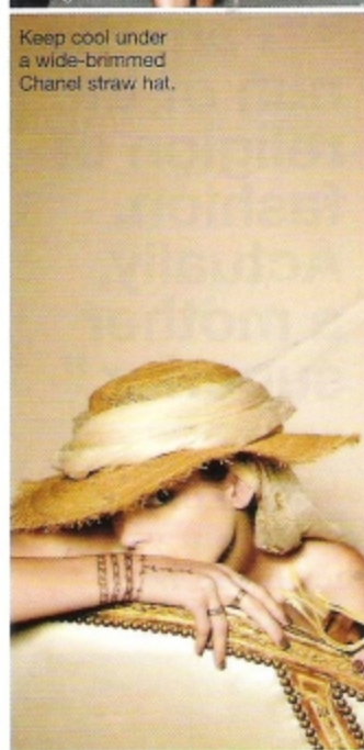
Keep cool under a wide-brimmed Chanel straw hat.